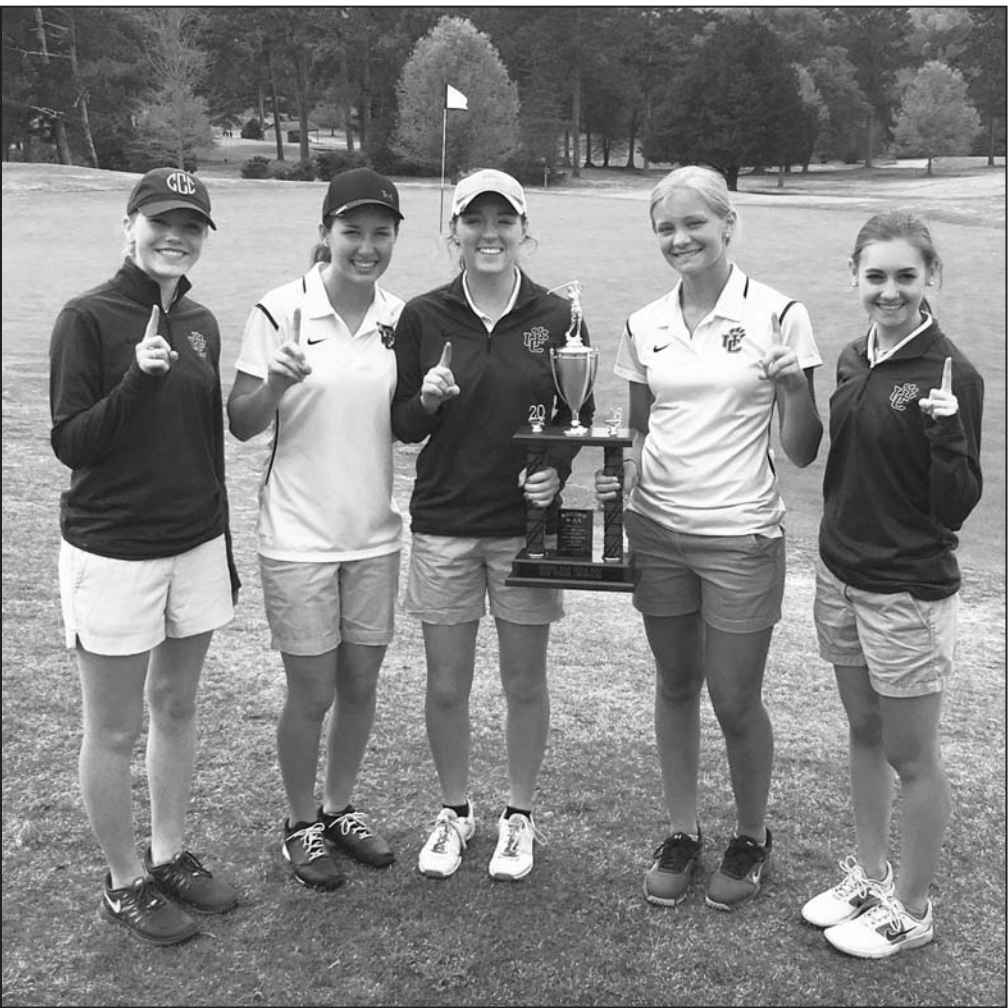
The Union County Lady Panthers golf team blistered the competition and the course at the Region Championships before narrowly missing a State Championship for the second straight year.